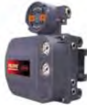
Digital valve positioners (DVC's)