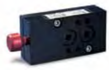
Block & bleed valves

All of the above fit together by way of standard product interfaces such as NAMUR for solenoid and switch box connections and ISO-5211 for valve flange connections. Using these well known international standards ensures that El-O-Matic products will comply with application requirements in projects worldwide