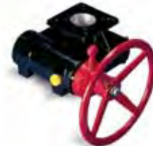
Manual override gear-boxes

In addition, these accessories often include dedicated options like;