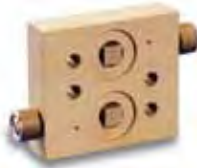
Speed control plates

In addition, these accessories often include dedicated options like;