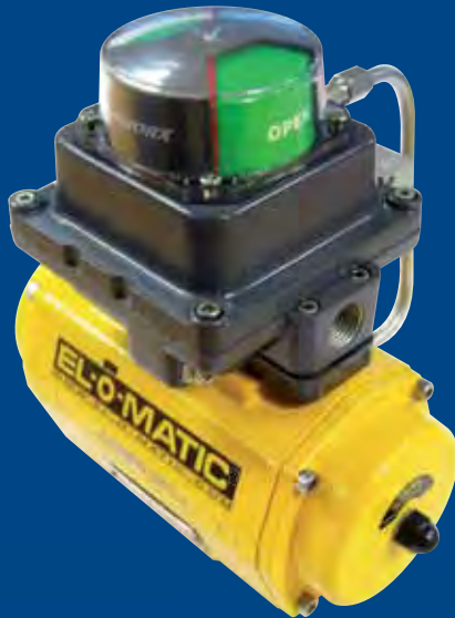
El-O-Matic actuators with TopWorx accessories